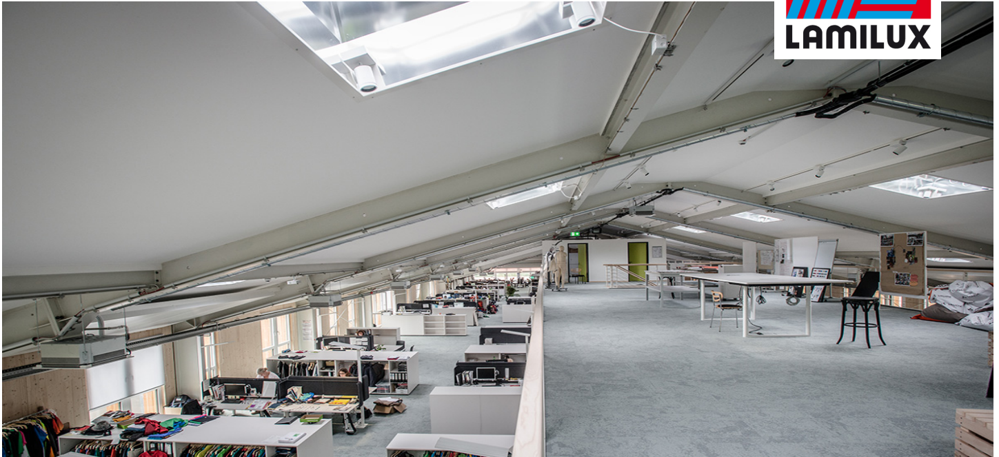
VauDe, Tett nang