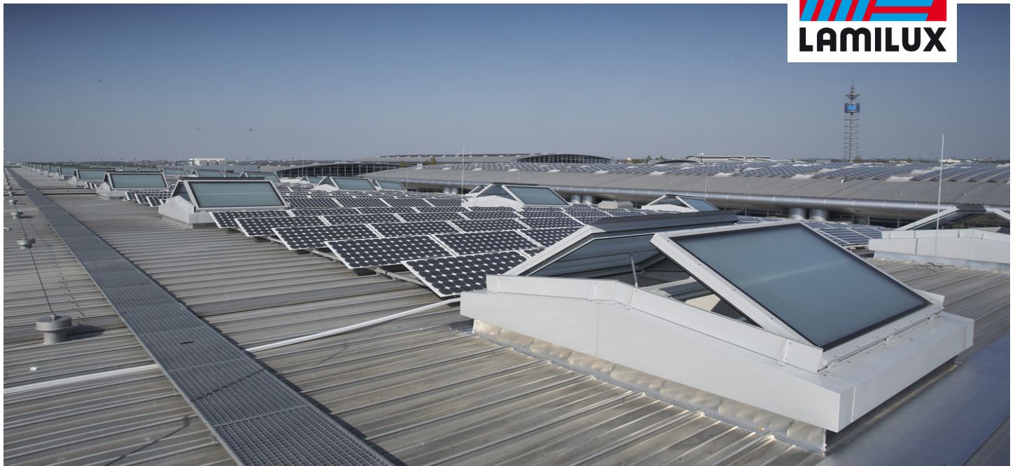
Exhibition Hall A4, Munich